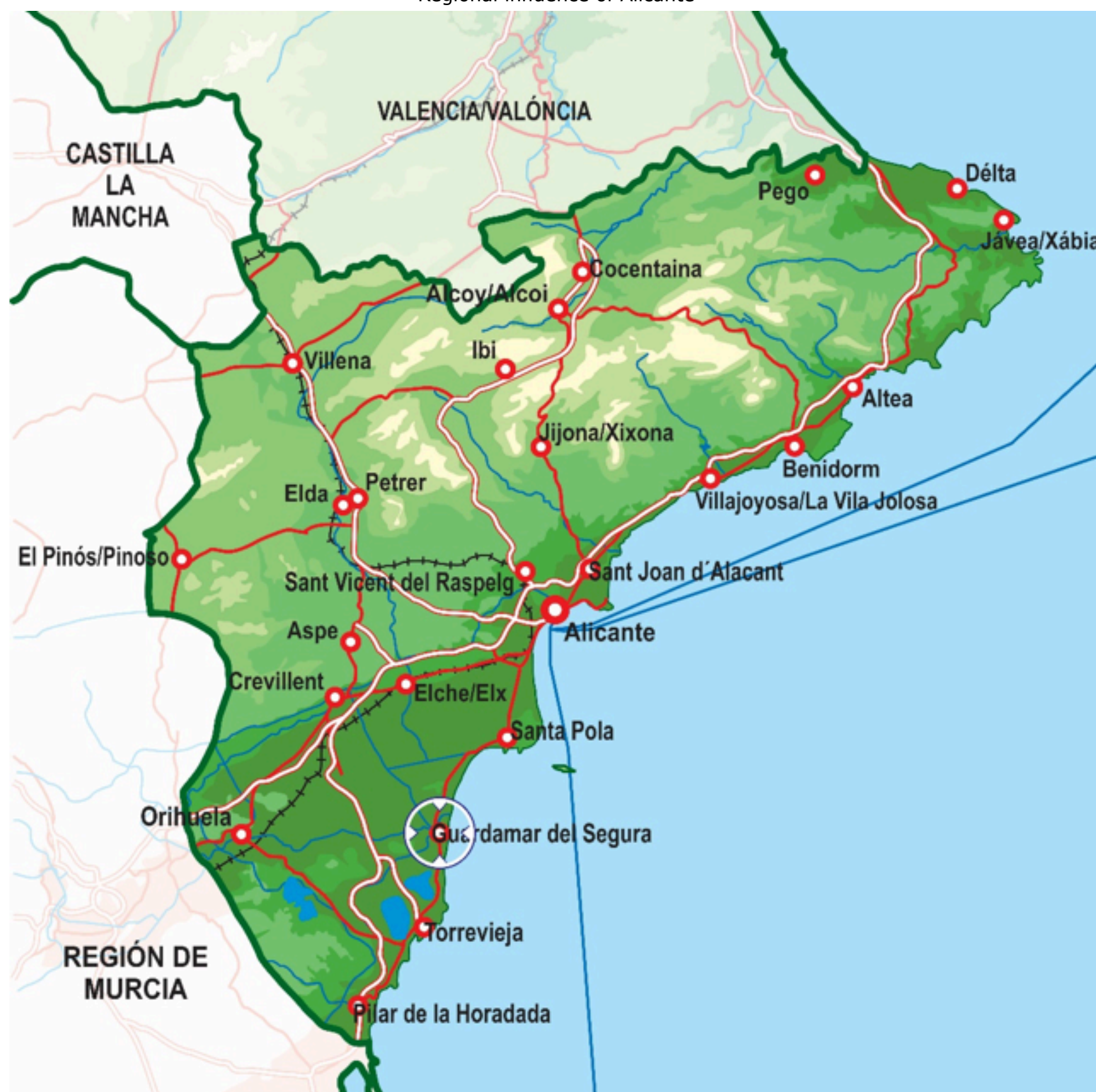
Figure 3 Regional influence of Alicante

It is located in the municipality of Alicante, it has a total area of 2,378.2 hectares. It is surrounded by the Crevillente, Callosa and Orihuela sierras, in a tectonic depression called Elche plain located south of Baix Vinalopó, district of Alicante. It is near Santa Paola salt marshes, with which it has a common origin (Andarías, 1996).